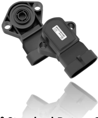
360 ° Standard Rotary Sensor