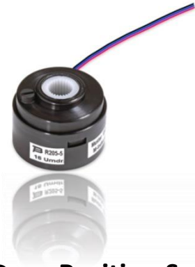
Rear Door Position Sensor / Tailgate Position Sensor

Detection of headlight setting, application in headlight range control systems.